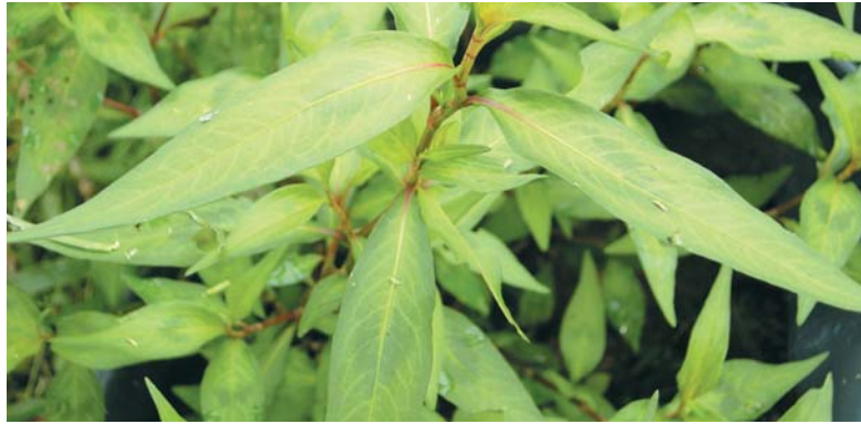
Kesum, used in laksa due to its peppery flavour, is among the herbs found to have high levels of antioxidants.